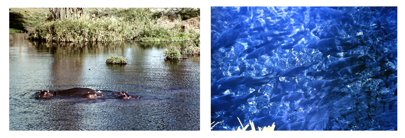
The Mzima Springs pool with the home-hippos at ease despite plenty of fishes around d them.

Of course I was greatly expected at the office as obviously the construction works at Wazo Hill near Dar-es-Salaam were in their final phases. Also the construction works started at Bamburi Works at the new Garage cum Workshop, the new crusher and Cement Mill 3. The 3 houses for members of the Medium staff could be seen behind the bougainvillea bushes planted along the factory approaching road already. Also the contract has been signed with Mowlem International Kenya Ltd. for the construction works on the Bamburi Works extension that included the first rotary kiln here. I knew that there was no escape for me and just plunged into the job at once. The first visit to Wazo has been booked for the next week by my secretary. Tibor Gaal proved to be an efficient deputy during my absence too so we made together the first inspection of local worksites in that morning too. Of course I had some "serious words" with the Garage Superintendent regarding the maintenance of my car. I have threatened him that I would "change" the design of his office in the new Garage if they would not maintained my car perfectly using and use original VW spare parts in future.