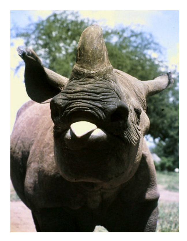
Zvonko got into trouble wanting to take a picture from the front of Rufus. The young rhino probably took the camera is a tidbit. Without any chance to retreat back Zvonko took this picture lying on his back on an earth dam.

SEAGULL motor and the official boat launching was not to be successful at first. A big wave hit the rather light boat sideways filling it up to the brim so we sunk onto the sand in shallow waters. Thus water got over the outboard motor as well so that first jaunt was a real disaster. Well, the Seagull is rather sturdy machine and after proper washing it worked fine in dry condition though. On our next attempt we might have more luck – we hopped at least. What we have to learn was the launching of the dinghy into waves.